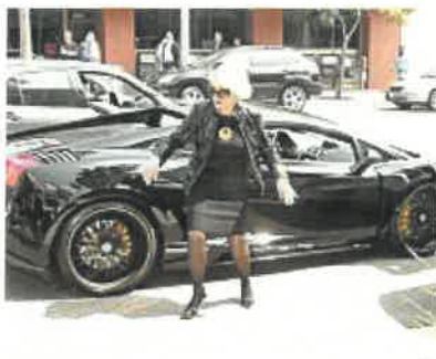
Broke and Famous. 15 Stars That Lost It All.