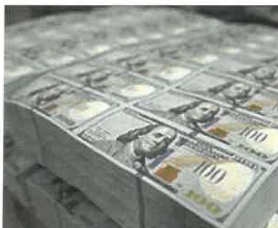
An Extremely Brilliant Way To Pay Off Mortgage