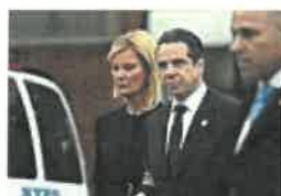
Cuomo caught between de Blasio, cop unions over police bill