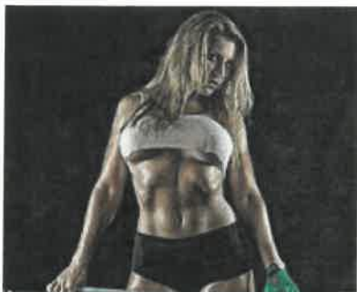
15 Hot Female Athletes Who Are Only Famous For Their Looks