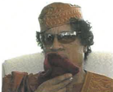
20 Richest People Of All-Time