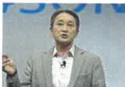
Sony CEO breaks silence on 'The Interview' hack