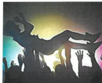
11 Things You Should Never Do Again After 50