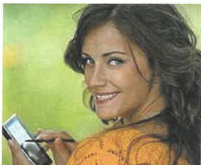
Why This App is Quickly Replacing Human Financial Advisors